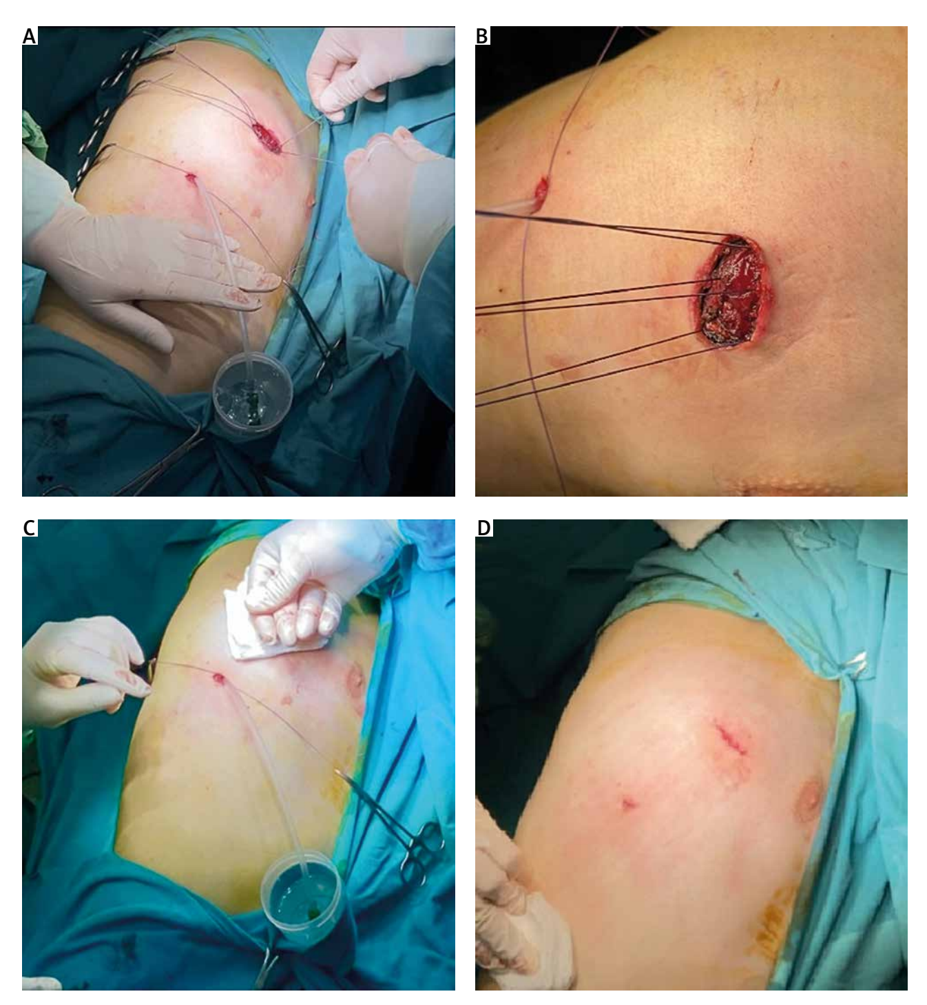
Figure 1. A – A 14-ch green Nelaton catheter is inserted via a camera port and immersed in a water container. B – The utility incision is closed with interrupted polyglactin sutures. C – After the parenchymal leak test is performed, the lung is hyperinflated by the anesthesiologist, while the utility incision is compressed with gauze to prevent subcutaneous emphysema. D – When the air leakage in the container stops, the Nelaton catheter is removed by applying suction

of hospital stay was significantly shorter in the drainless group, and this result was compatible with the literature.